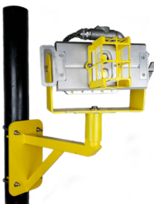
Pipe Clamp #PC4-AL