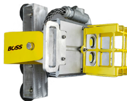
Magnet Mount #MM-AL