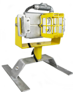
Floor Stand #FS-AL