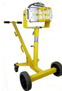
Cart Mount #CM-AL