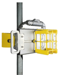
Scaffold Clamp #SC-AL